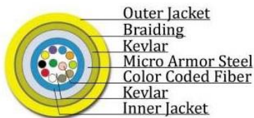
TiniFiber Micro Armor Fiber

Fiber Count: 12 Diameter: 5.5mm Weight: 98 lbs.