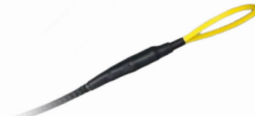
Pulling Eye Kits