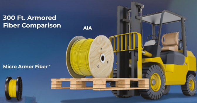
300 Ft. Armored Fiber Comparison

TiniFiber's small size and lightweight also reduce shipping and warehouse costs by up to 66%.